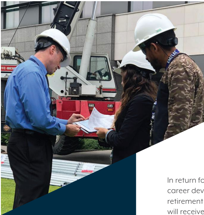
Facility Manager reviewing the contractor's lifting plan to make sure it met EM-385-1-1 requirements at U.S. Embassy Quito.