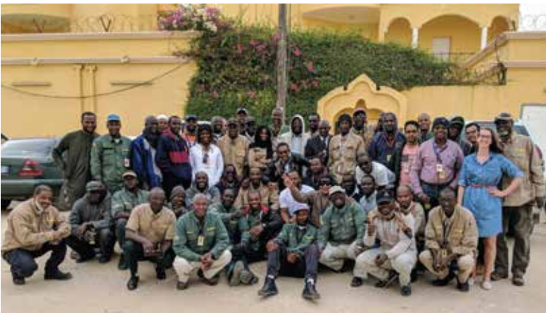
Facility Management section at U.S. Embassy Nouakchott

OBO teams work on challenging projects and apply design principles of excellence to all aspects of embassy and consulate infrastructures. They coordinate initiatives and overcome obstacles to deliver safe, secure, and well-designed embassy complexes that represent the best of American architecture, engineering, technology, art, culture, and conservation.