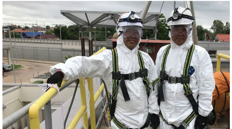
U.S. Embassy, Vientiane Lao PDR: Facilities Maintenance Plumbers wear full body protection for working inside water tank.

To accomplish its goals, the Bureau of Overseas Buildings Operations (OBO) recruits, selects, and hires skilled Foreign and Civil Service specialists with established experience in all areas of the construction, building, facilities, and operations maintenance industries. For those interested in living and working abroad as a Foreign Service Facility Manager or Construction Engineer, you must be available and willing to serve anywhere in the world that requires your expertise. You must also meet the minimum education and experience criteria as outlined below: