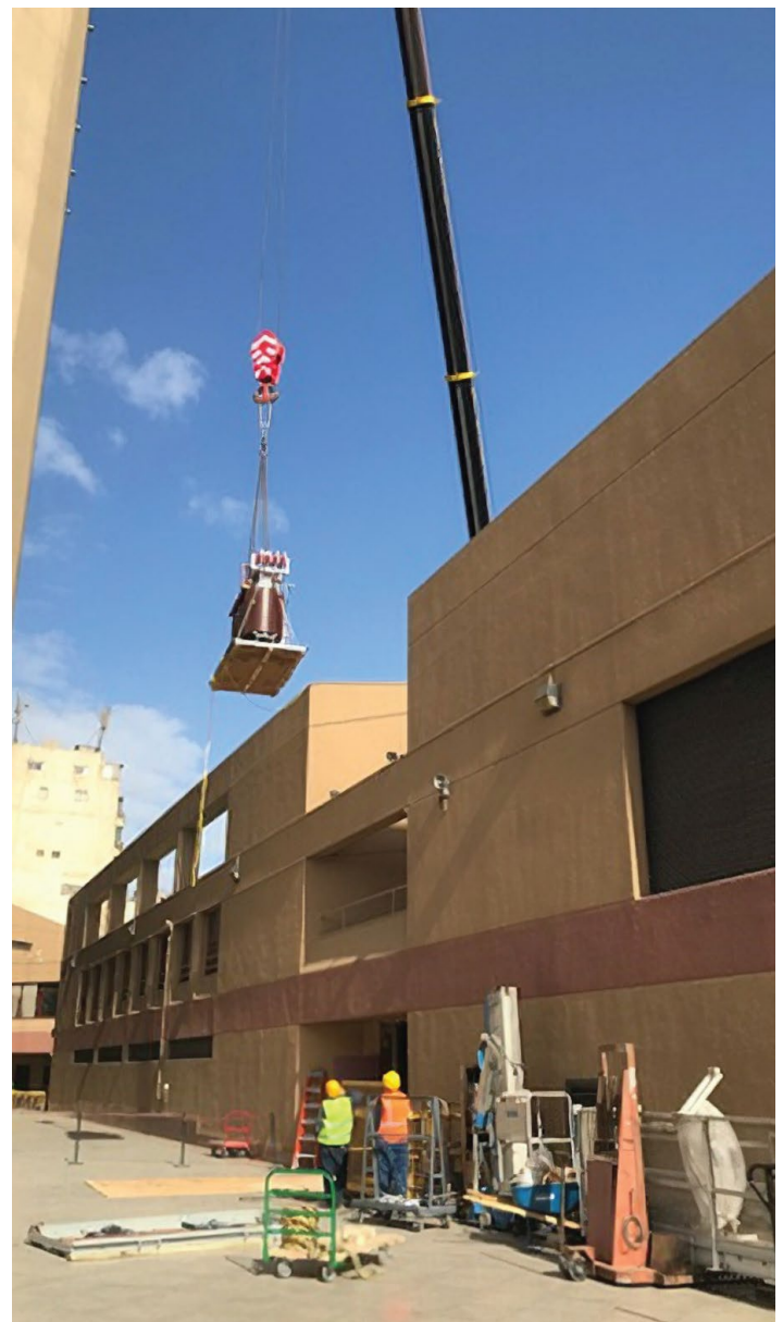
Generator crane lift to 14th floor at Cairo Tower #1, U.S. Embassy Cairo

Visit careers.state.gov/OBO for more information or you can contact OBO directly via email at OBORecruit@state.gov .